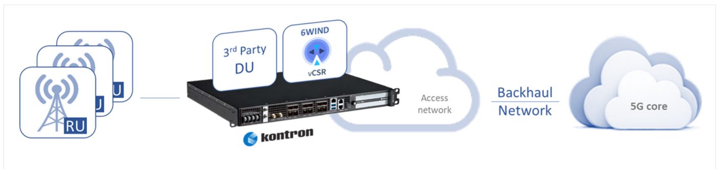
Figure 2. 6WIND virtual cell site router in a typical cell site.

Figure 2 shows a cell site deployment scenario where the distributed unit (DU) aggregates multiple radio units (RU), the aggregated traffic is then backhauled to the provider edge and core. As a result of the 6WIND vCSR running on top of the Kontron ME1310 as a VNF, the need for a discrete hardware-based cell site router is eliminated. This reduces capital expenditure, simplifies deployment and operations for each cell site deployment.